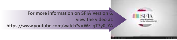
For more information on SFIA Version 6, view the video at: https://www.youtube.com/watch?v=WzLgT7y0_YA

Now in version 6, the Skills Framework for the Information Age (SFIA) has become the globally accepted common language for the skills and competencies required in the digital world.